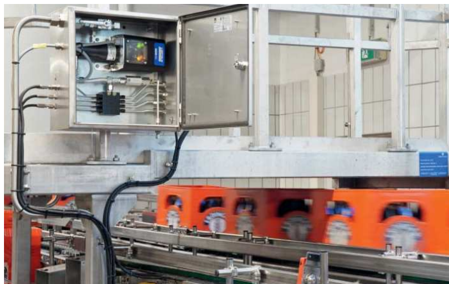
View into a section cabinet with EDL1, progressive feeder and stopcock to the main line

Erdinger and the machinery supplier brought in SKF, which had already been a partner in the installation of a two-circuit system in the past, to implement their project. The zoned system now implemented by SKF is equipped with the new EDL1 (Electric Driven Lubricator) systems, which are electrically driven and easy-to-use pressure-booster pumps capable of generating high outlet pressure from low inlet pressure.