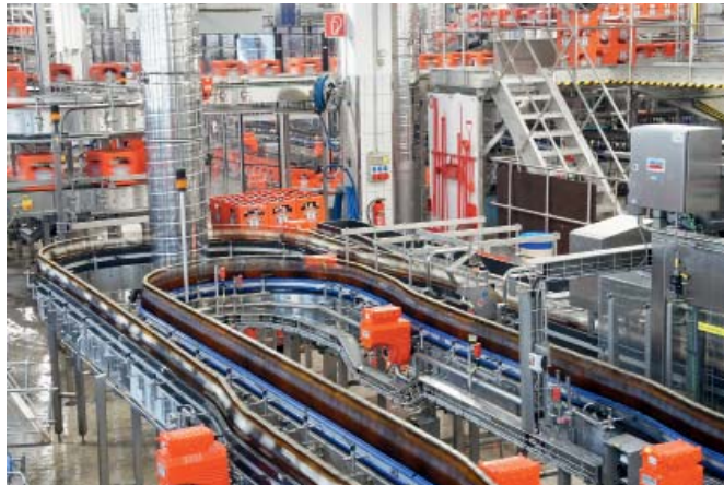
The complex filling system at Erdinger Weißbräu necessitated division of the lubricating system into individual zones

With the LMC 301, SKF has created a cost-effective solution whose modular nature avoids "over-sizing" of the control unit.