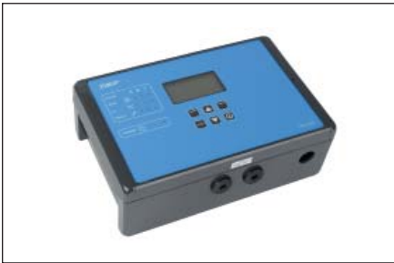
The compact, expandable modular LMC 301 control and monitoring unit with LCD display and six function keys for programming, configuring parameters and signaling

SKF equipped Erdinger's entire filling plant with the system to grease machinery and rolling bearings on conveyor belts. A total of more than 3,000 lubrication points in two halls and a connecting tunnel were connected to the zoned system. This system consists of 90 sections (=zones) and three drum pumps that supply the main lines.