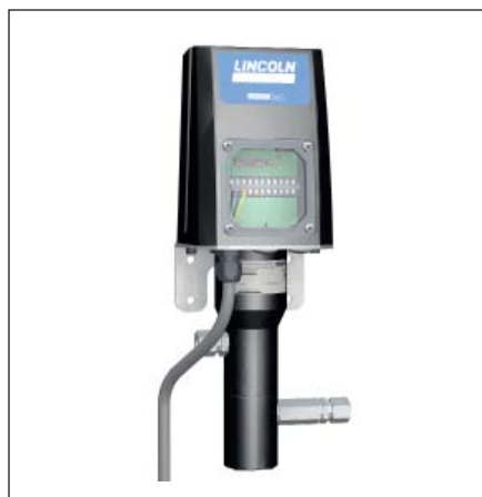
The EDL1 by SKF is an innovative metering and pressure-booster pump that increases an inlet pressure of at least 2 bar to an outlet pressure of up to 280 bar

The lubrication system is supplied by a large drum pump that feeds grease to the main line through to the decentralized EDL1 pump installations. These boost the pressure to up to 280 bar, ensuring that the many locations even in distant points are reliably supplied with lubricant.